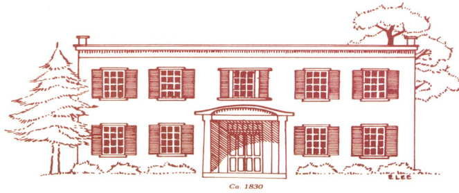
Pruyn House Cultural Center Town of Colonie