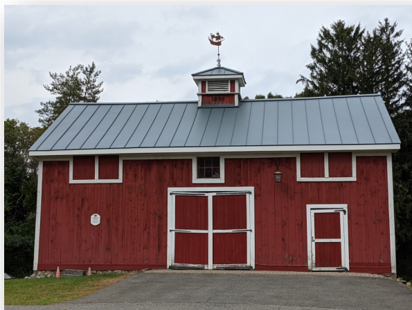
The 1850 Carriage House sporting its brand-new roof.

The William G Pomeroy Foundation has generously donated $1,500 to the Friends of Pruyn House to cover the cost of installing internet access throughout the property. This will be especially useful for on-site meetings, weddings, as well as personal access for members and visitors.