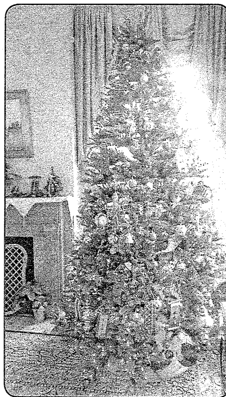
Christmas Decorations by Blue Creek Garden Club