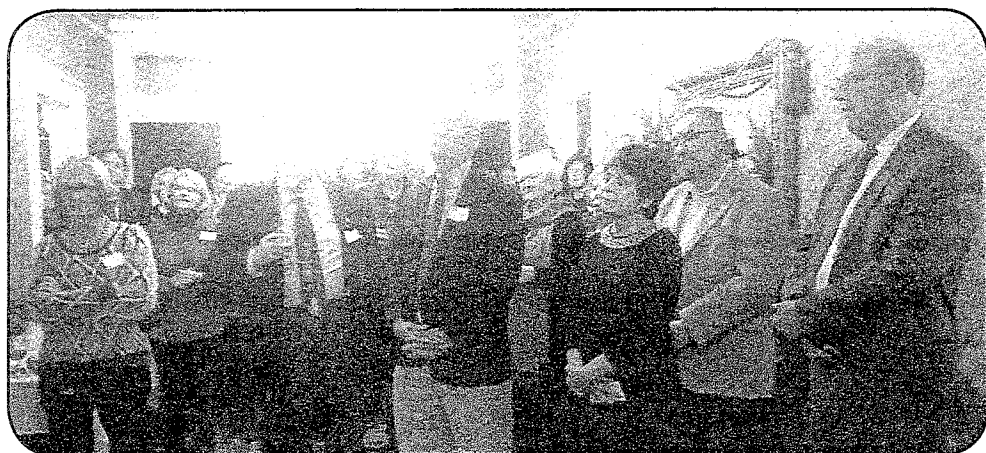
Friends of Pruyn House gathered together at the Holidays