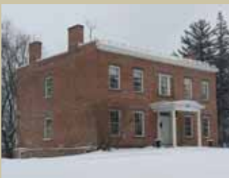
Photo of Pruy House after Phase I of reconstruction. Notice the new roof and parapet!

President's Message | 2 Capital Improvement | 2 Holiday Fun | 3 Board of Trustees | 4 New Members | 4 Thank You | 4 Spring Trip | 5 Wish List | 5 Upcoming Events | 5 Life on the Farm | 6 Annual Appeal | 7 Concert Schedule | 8 Docent Training | 8